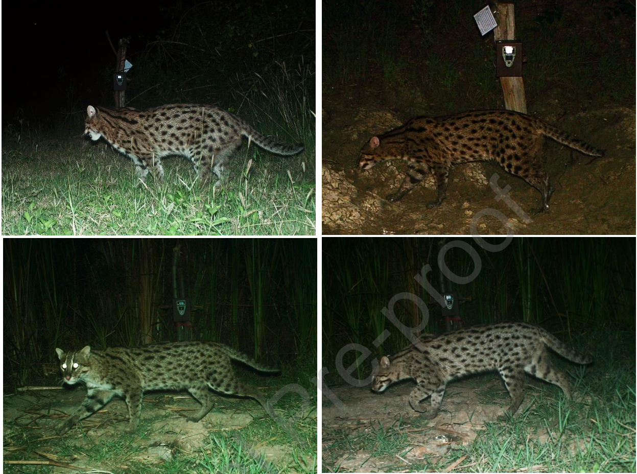
Fig. 3. Four left-flank photographs of three fishing cats. Two top photos are the same fishing cat individual captured at different camera-trap station and occasion. Two bottom photos are two different fishing cat individuals captured at the same camera-trap station with the top left photo.