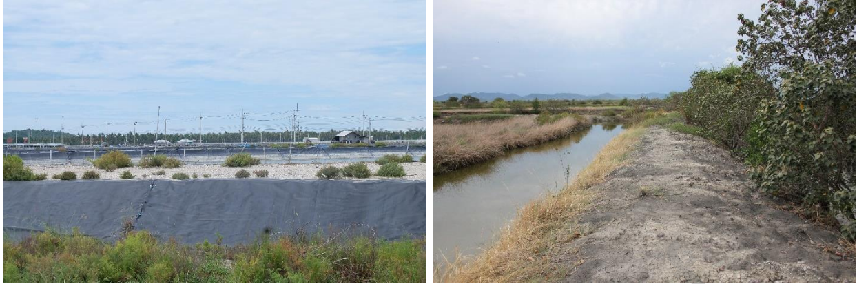
Fig. 2. Commercial-oriented aquaculture ponds (left) and traditional aquaculture ponds (right). Commercial-oriented ponds are deeper with more machinery and pond's beds are covered by plastic sheets, while traditional ponds had more vegetation cover and lack of these infrastructure.