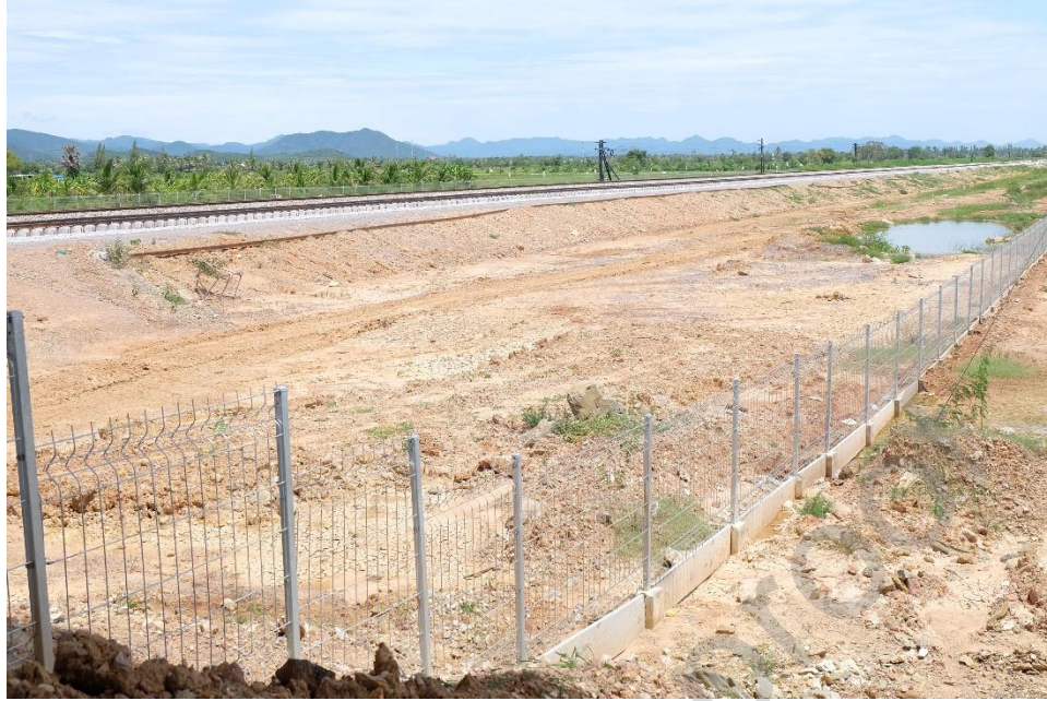
Fig. 5. Fencing adjacent to the double-track railway project intended to prevent livestock collisions (west side of the study area).