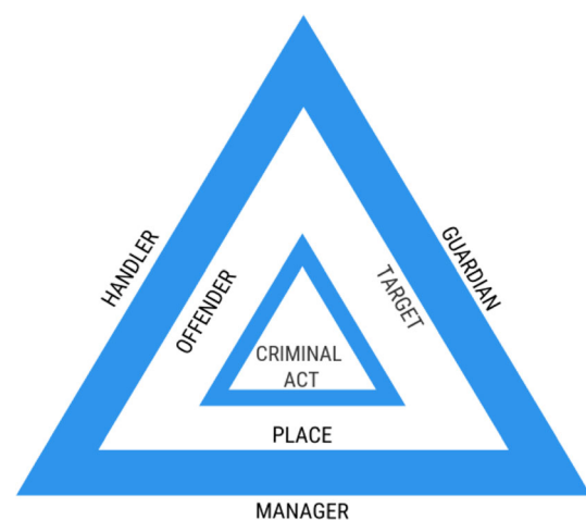
Fig. 1 The crime triangle (adapted from Eck 2003)